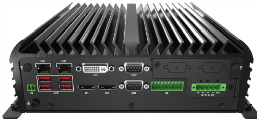
LPC 870 Back view